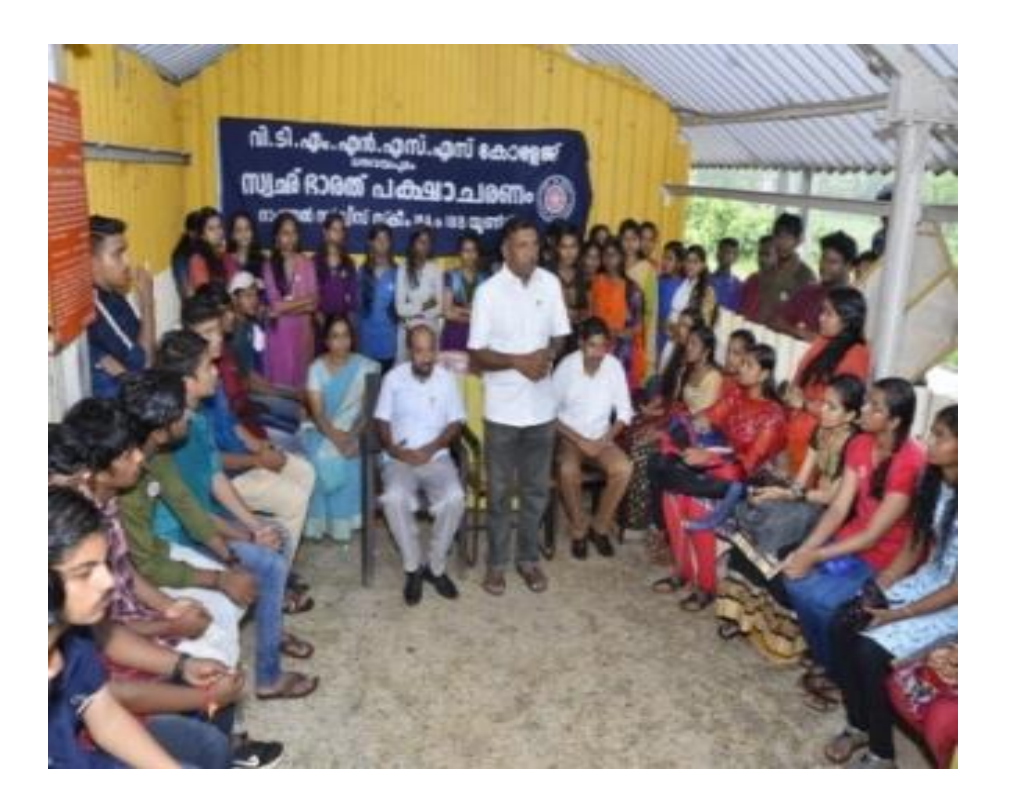
Volunteers are motivated to do social work and can communicate the importance of cleanliness to the society.