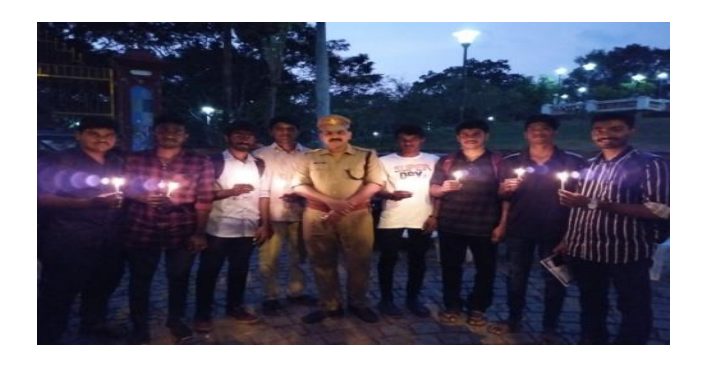
Extension of the service to the society.