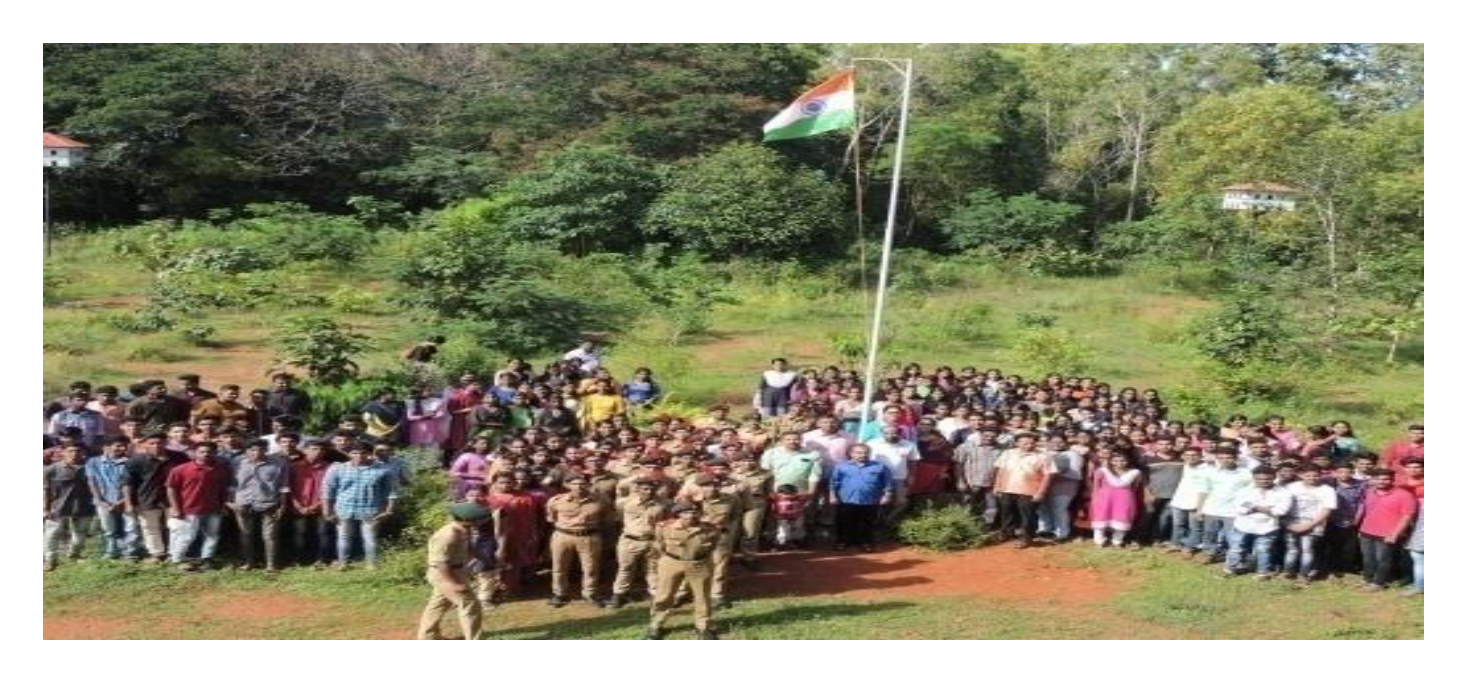
This Nurtured the interest on National Integration and motivated the participants