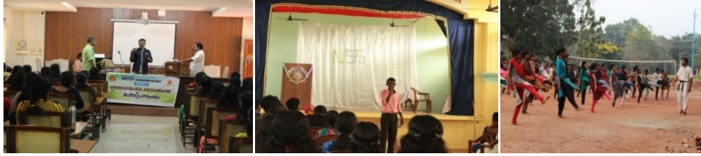
Group Activities & Cultural programmes