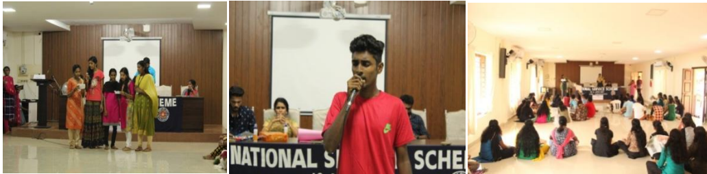
Class on disaster management